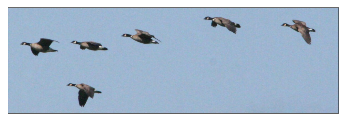
Figure 26: Aleutian geese in flight.