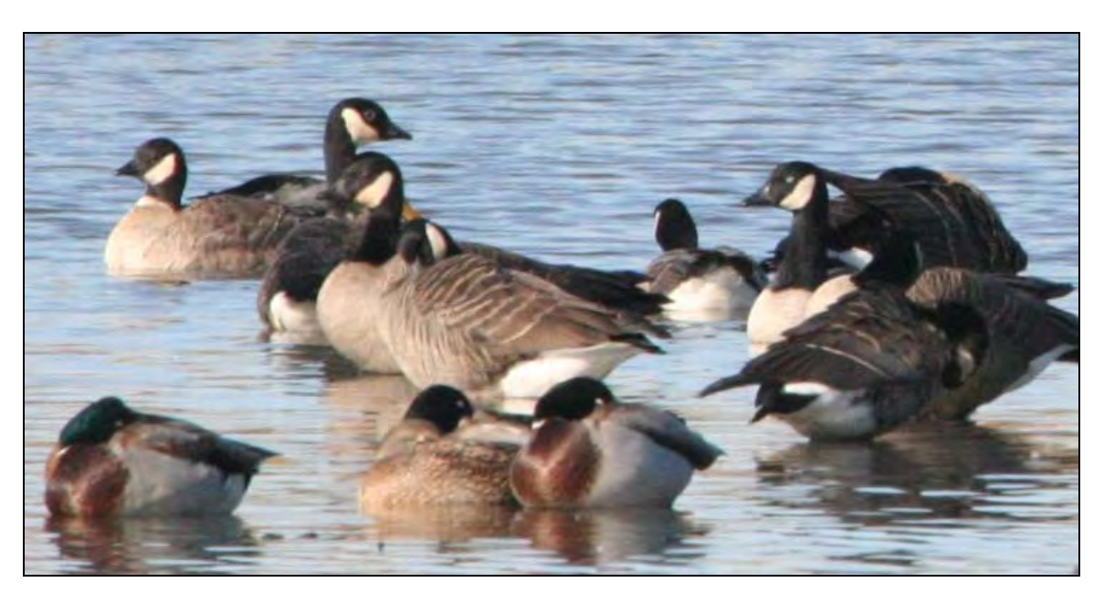
Figure 24: Aleutian goose (top left) with lesser Canada geese.