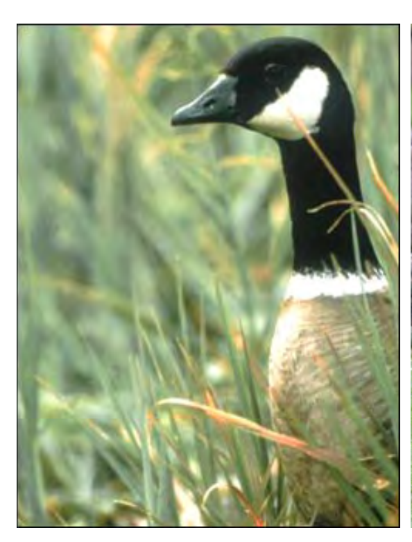
Figure 22: Aleutian goose.