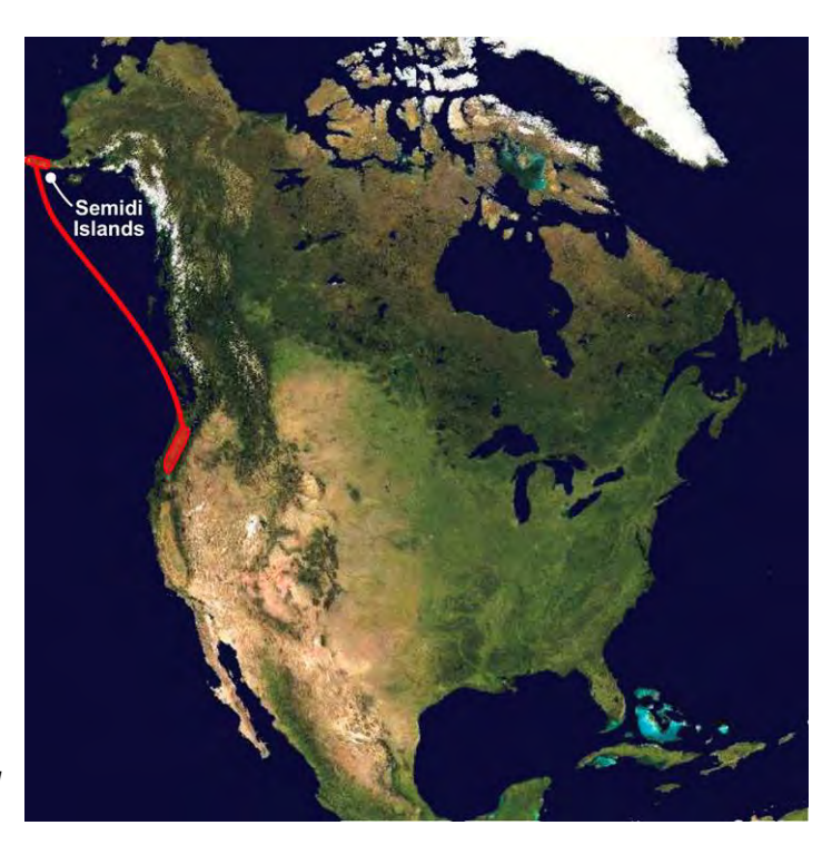
Figure 28: Nesting areas and migration route for Aleutian geese.

Aleutian geese nest in the Aleutians Islands of Alaska and primarily migrate along the Oregon Coast to wintering grounds in California (Figure 28). There is an extremely small breeding segment established on the Semidi Islands in the Gulf of Alaska, which winter mainly in Tillamook County, Oregon.