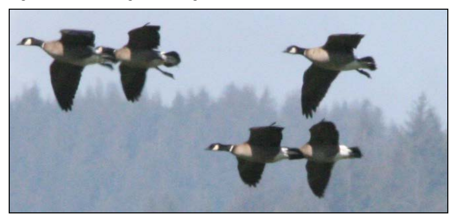
Figure 27: Aleutian geese in flight; notice white neck ring apparent on all birds.