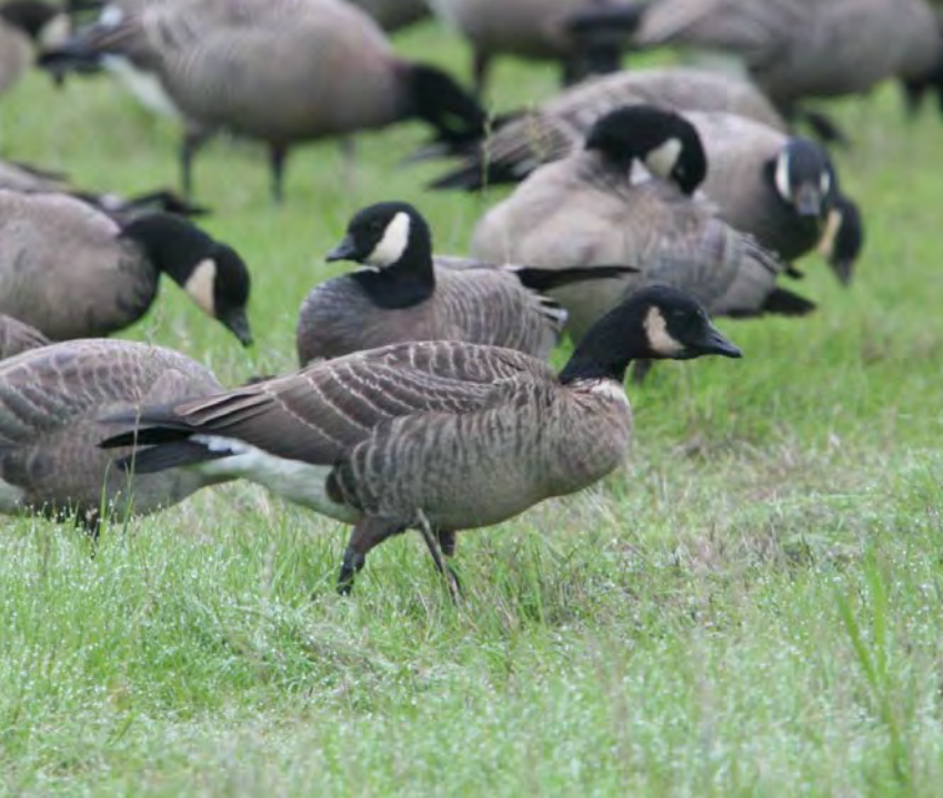
Figure 23: Aleutian goose showing broad white neck ring and purplish breast color.