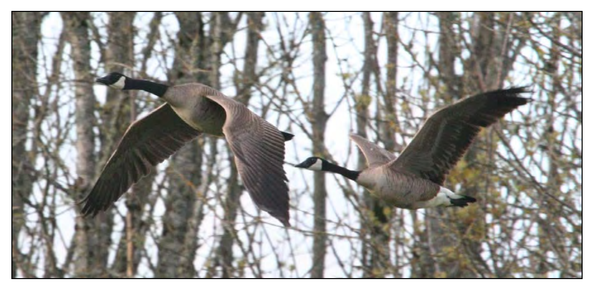
Figure 92: Western Canada geese in flight; notice long necks.