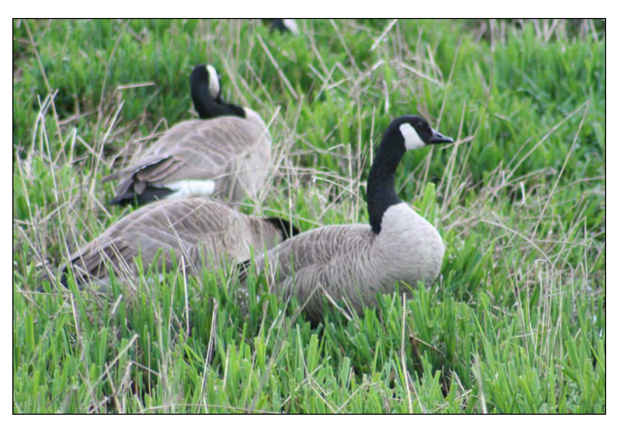
Figure 85: Western Canada geese; notice silver white breast with long neck and long culmen (bill).