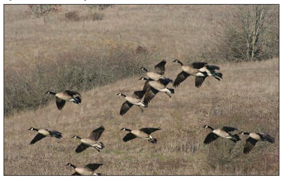
Figure 84: Western Canada geese in flight; notice long necks and whitish breast.