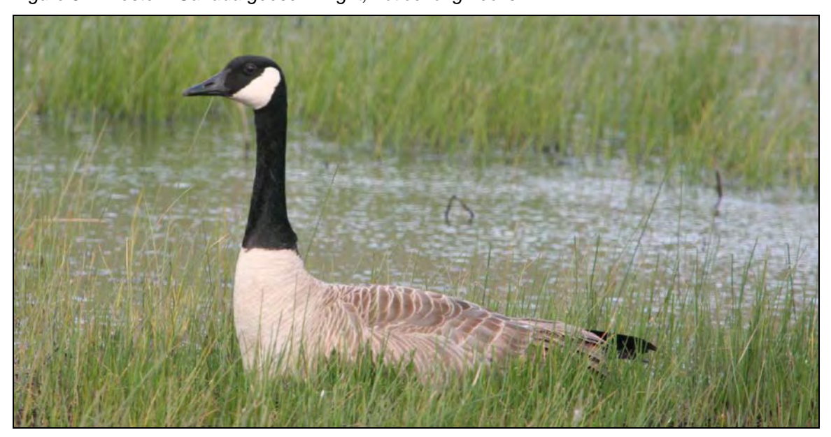
Figure 93: Western Canada goose; notice light color.