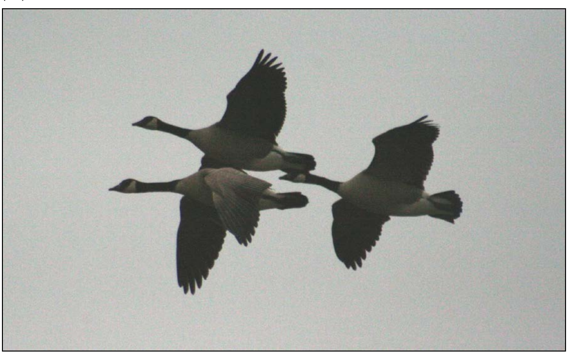
Figure 86: Western Canada geese silhouetted in flight; note long neck and broad wings.