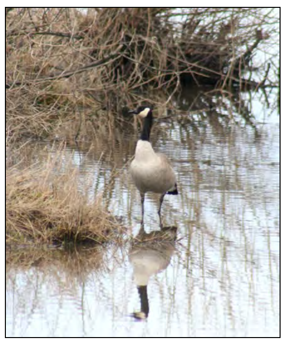
Figure 82: Western Canada geese are light in color.