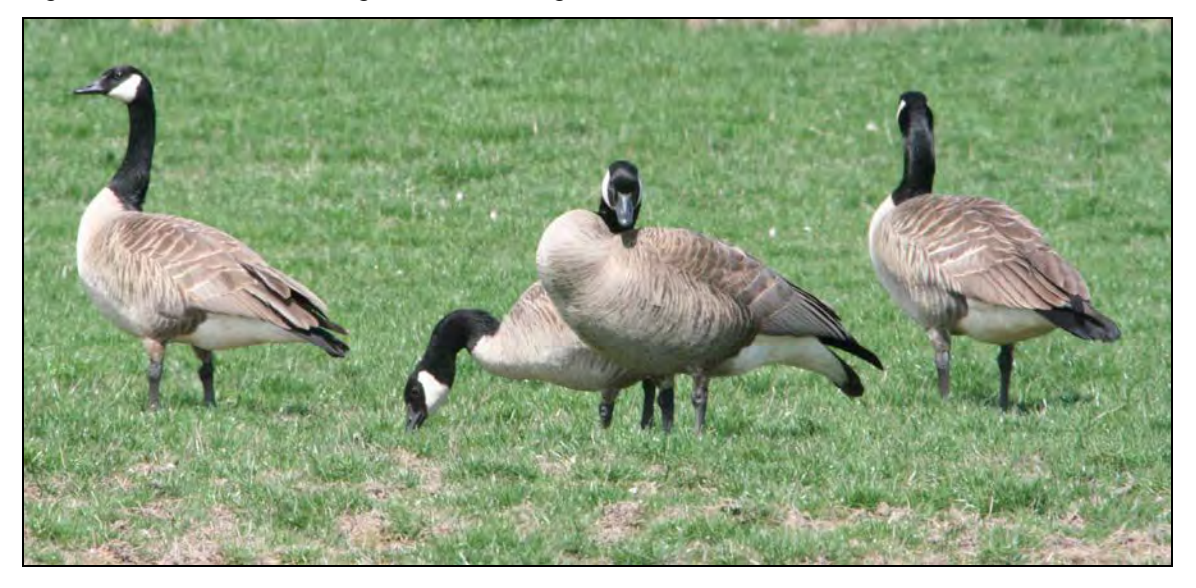
Figure 91: Group of western Canada geese.