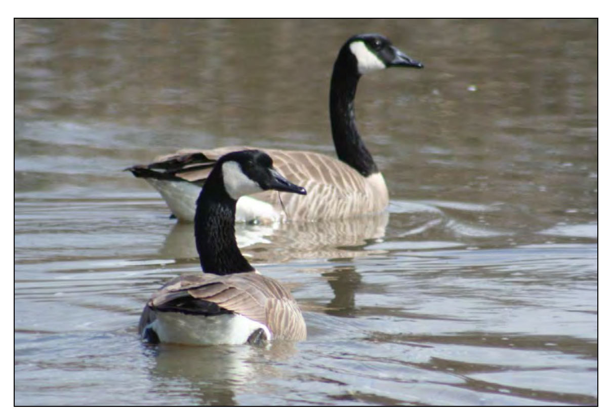
Figure 83: Western Canada geese.