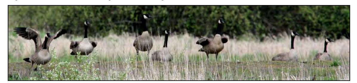
Figure 94: Group of western Canada geese; notice color differences between individuals.