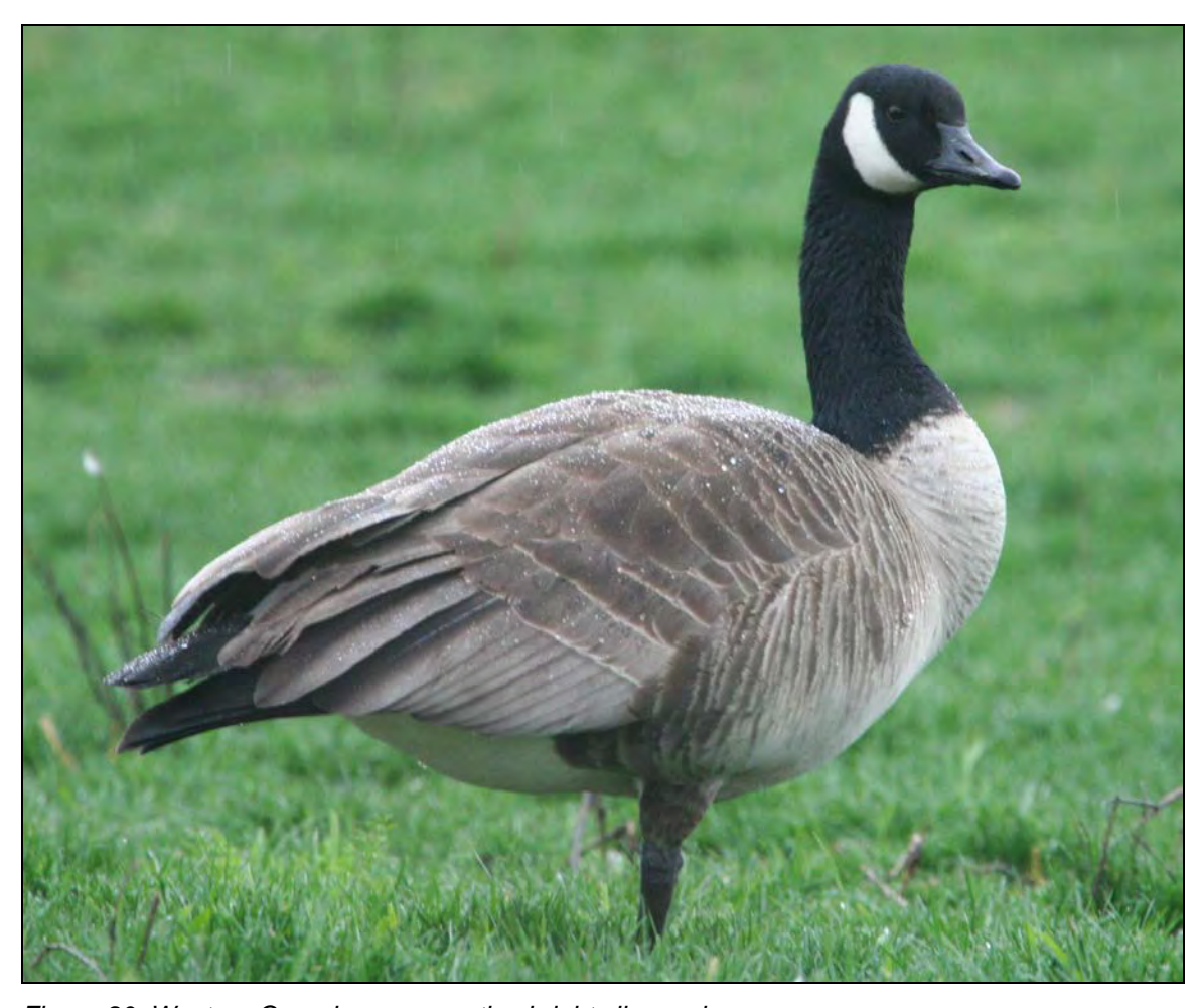
Figure 90: Western Canada goose; notice bright silver color.