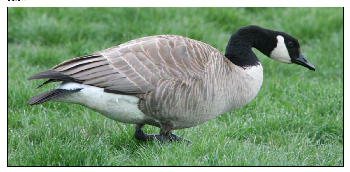
Figure 89: Western Canada goose feeding.