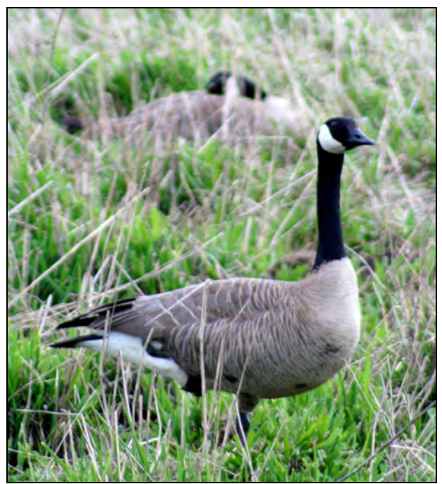
Figure 81: Western Canada goose.