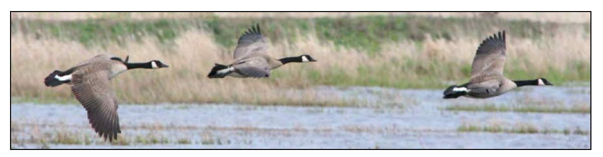
Figure 87: Western Canada geese in flight; notice light color, broad wings and long neck.