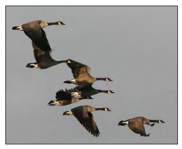
Figure 95: Group of western Canada geese in flight.