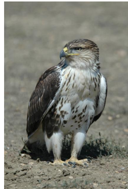
Ferruginous hawk.