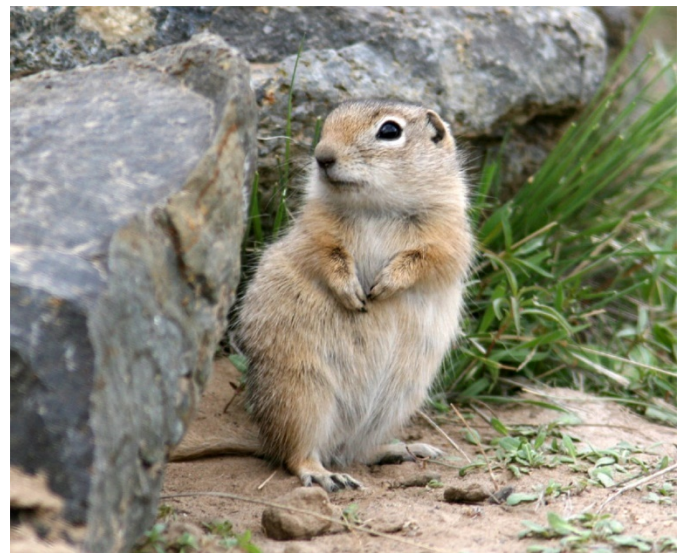
Washington ground squirrel.

For more information, contact your local service center and USDA Farm Service Agency office at farmers.gov/service-center-locator , or the Washington Department of Fish and Wildlife private lands biologist for your area at wdfw.wa.gov .