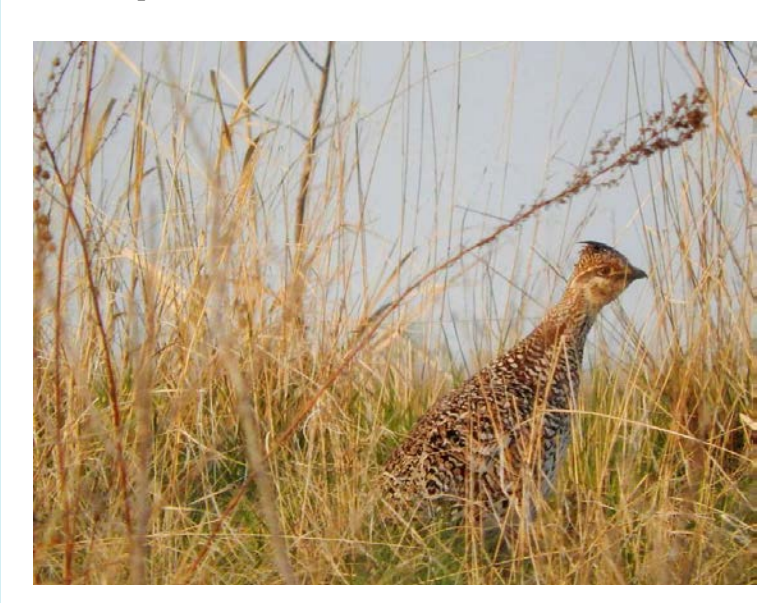
Columbian sharp-tailed grouse.