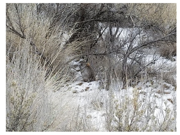
Columbia Basin pygmy rabbit.

For more information, contact your local service center and USDA Farm Service Agency office at farmers.gov/service-center-locator , or the Washington Department of Fish and Wildlife private lands biologist for your area at wdfw.wa.gov .