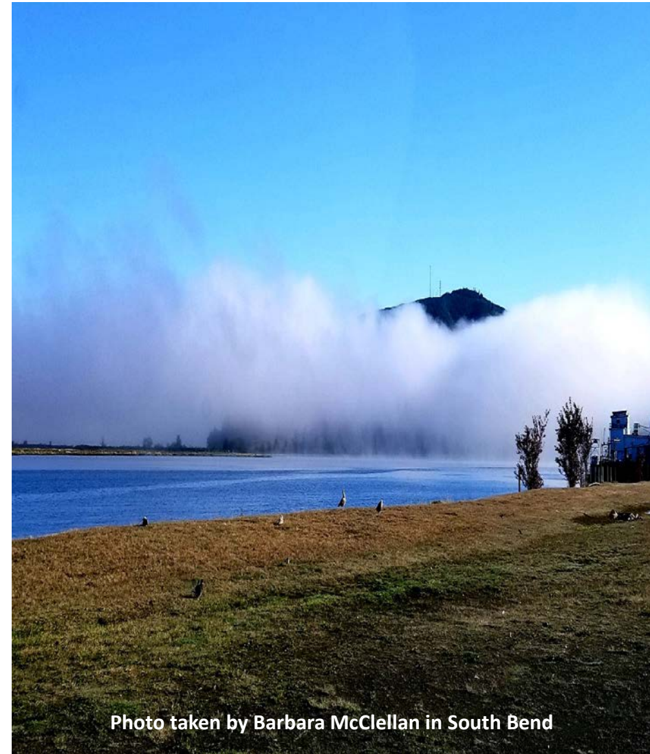
in South Bend