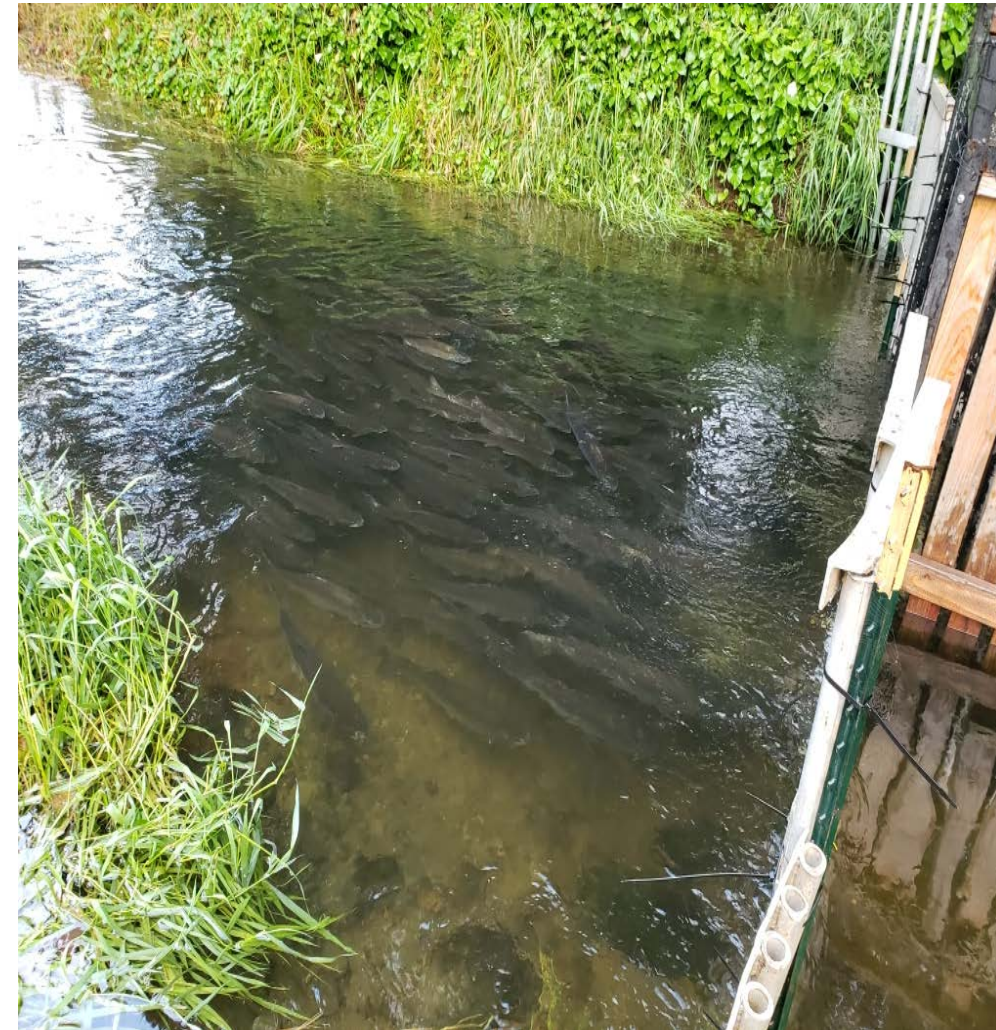
at Naselle Hatchery Attraction Channel