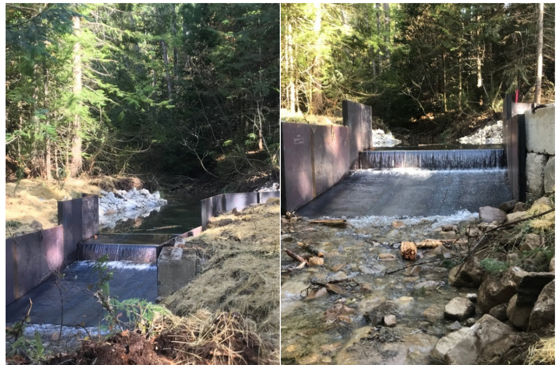
Photo 1. Flume Creek temporary fish management structure.