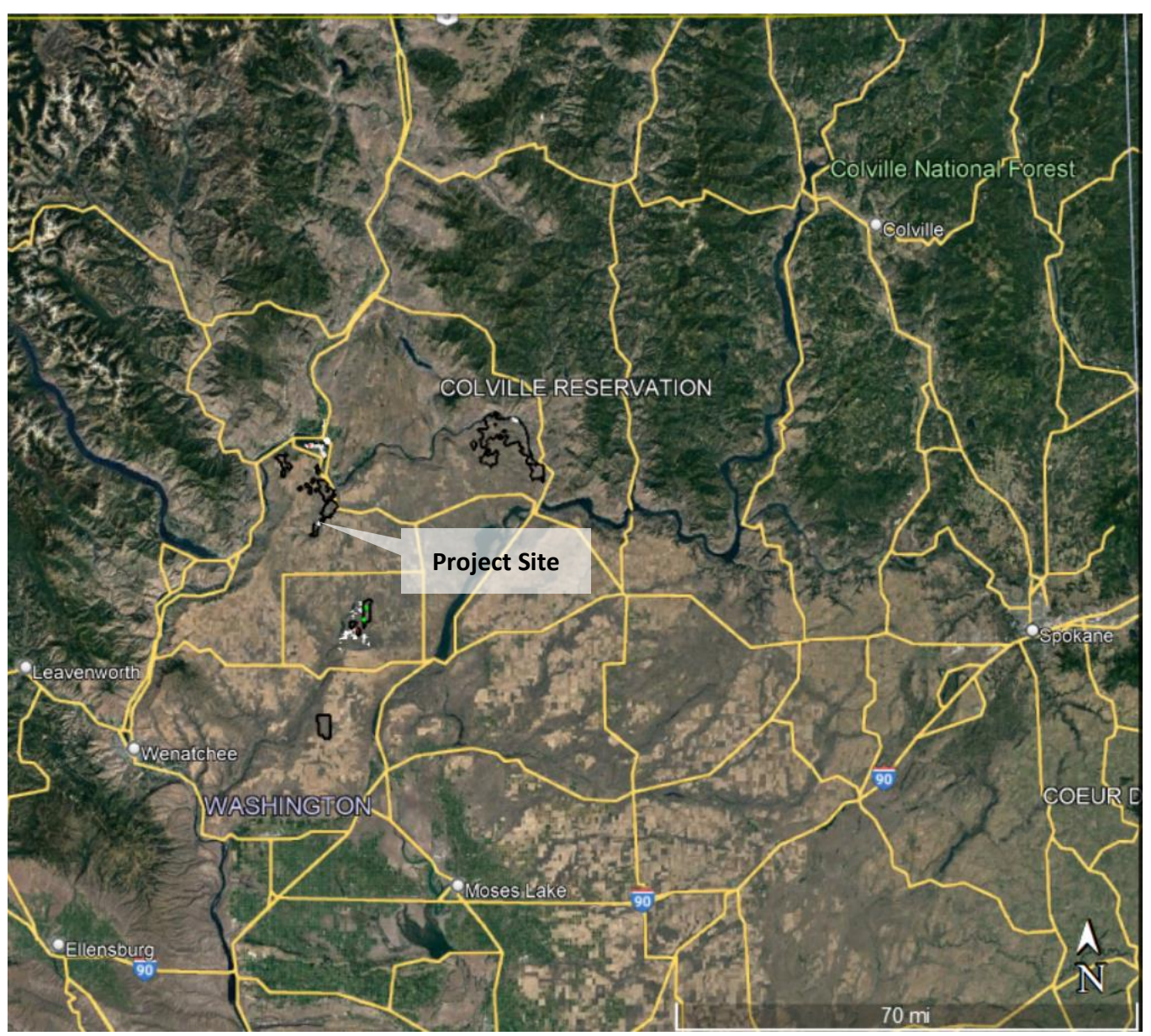
Map 1. Project site in relation to multi-county area.