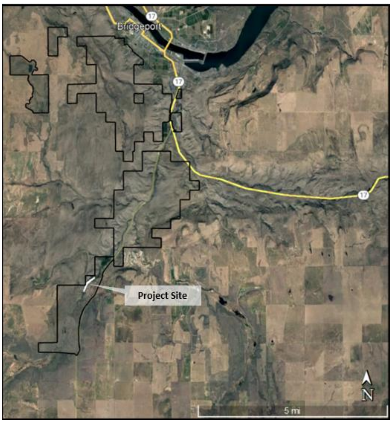
Map 2. Project site in relation to the surrounding area and local community.