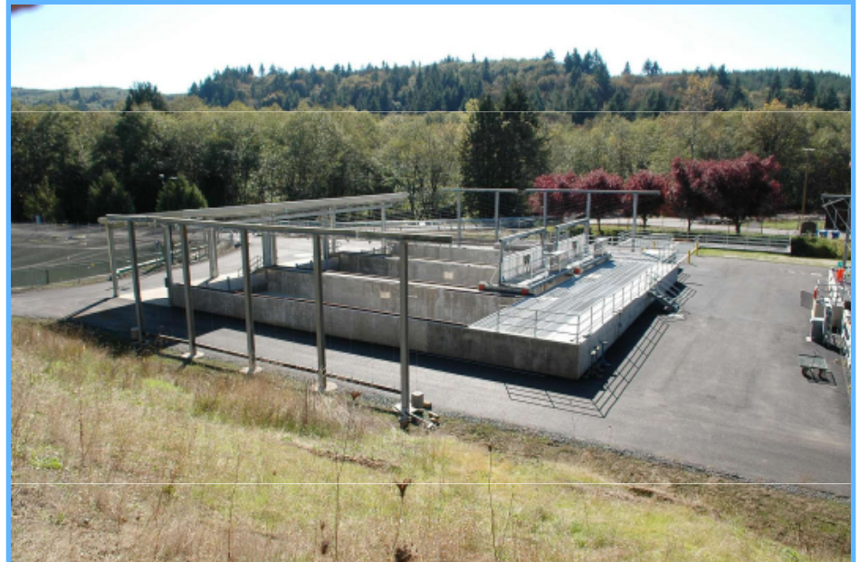
August 3-4, 2012, WDFW Commission Meeting Presentation

Information subject to changes and amendments over time.