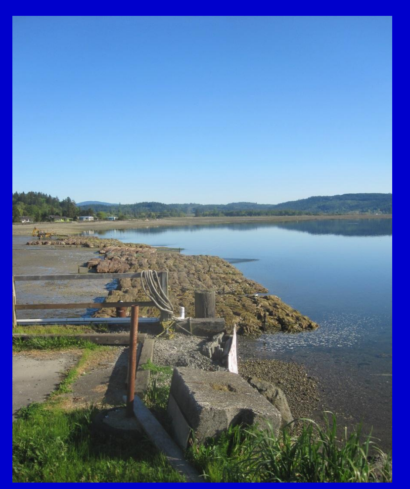
Commission Presentation February 7, 2014