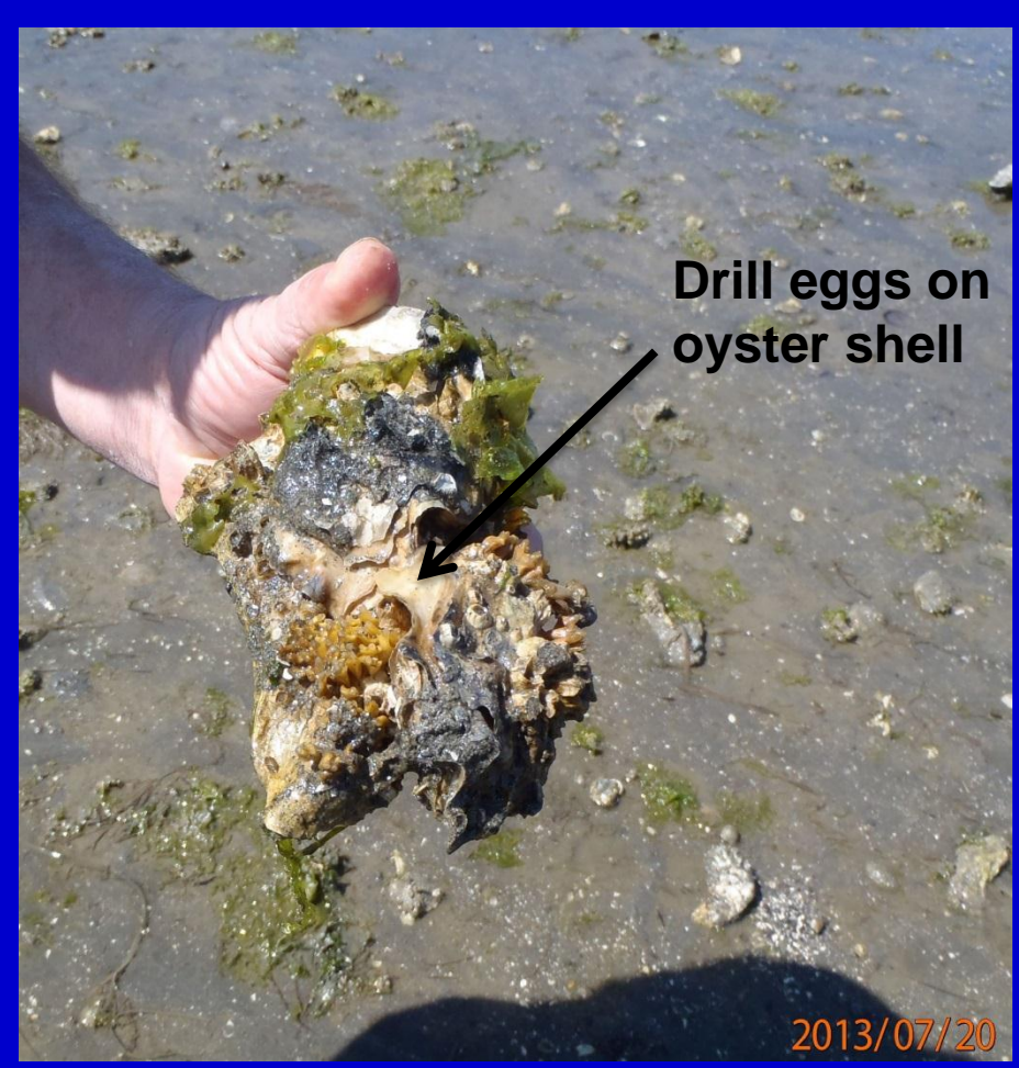
WA Dept. of Fish and Wildlife, Information subject to changes and amendments over time