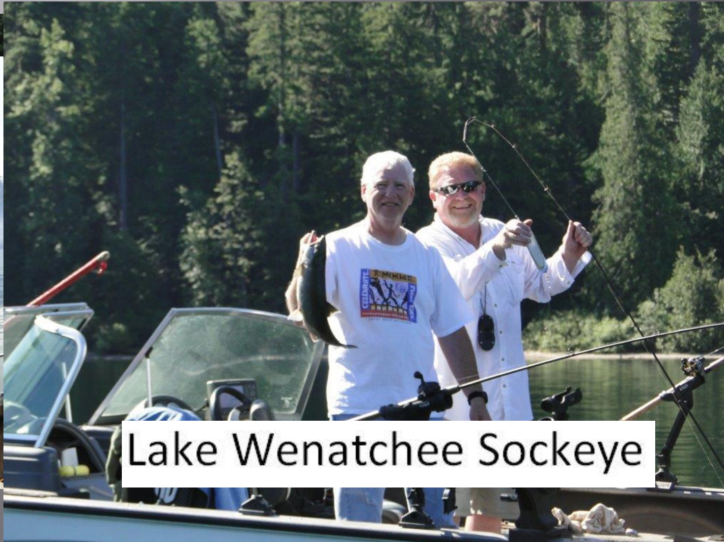
Lake Wenatchee Sockeye