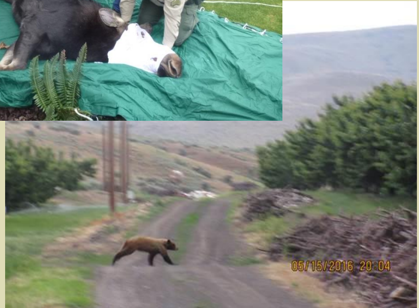
Bear in orchard west of Prosser.