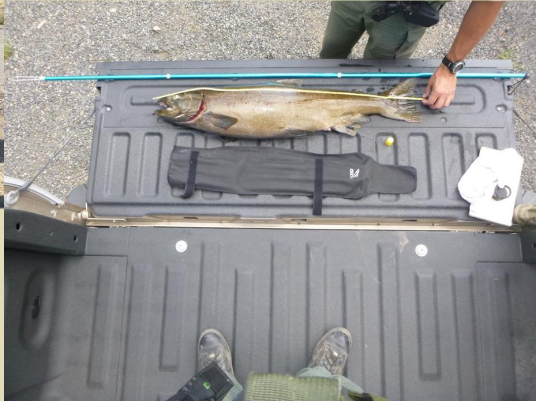
Chinook Salmon speared in the American River.