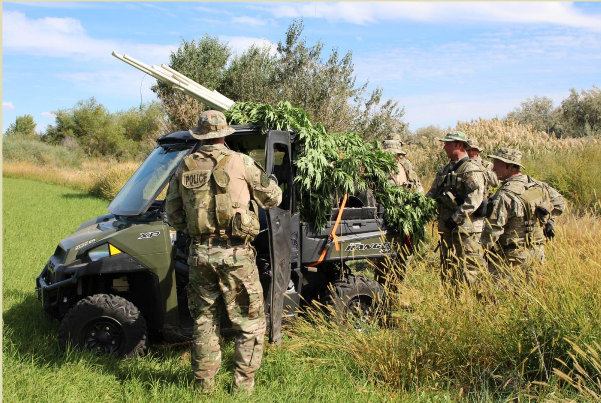
WDFW SOG team members loading illegal marijuana plants and grow items onto ORV.