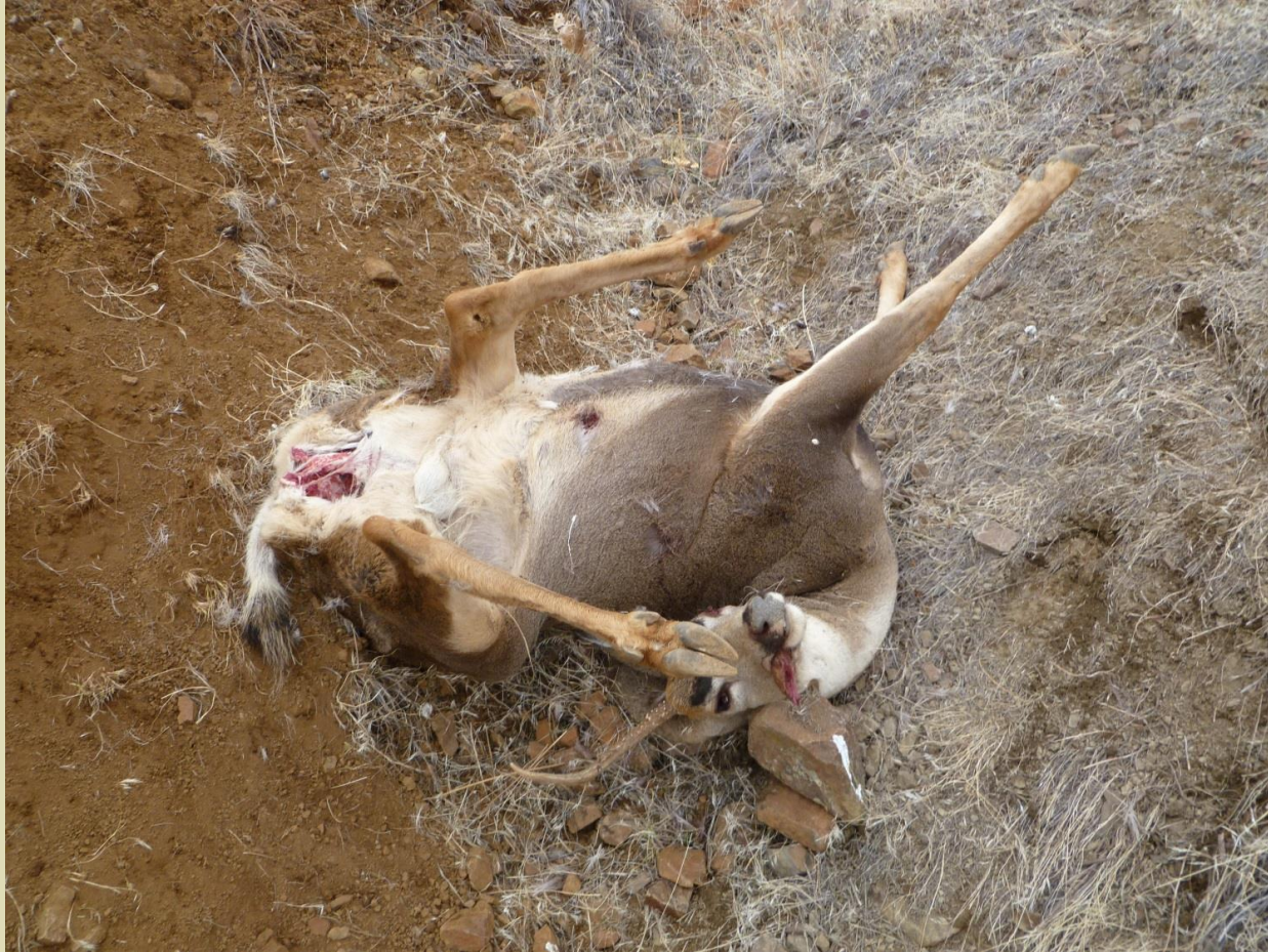
Two-point dumped off the cliff.