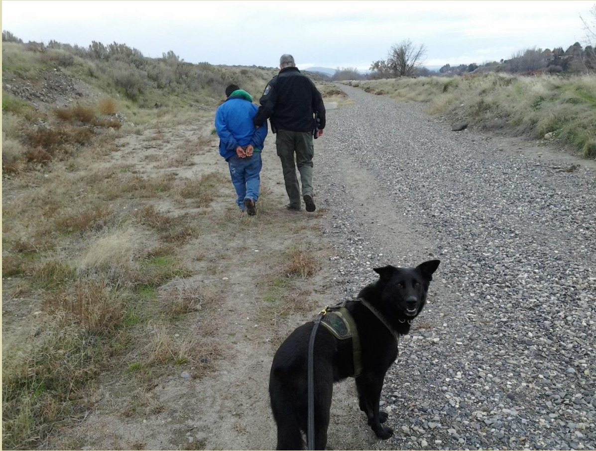
K-9 Olive - Subject Tracked and Arrested on Warrant