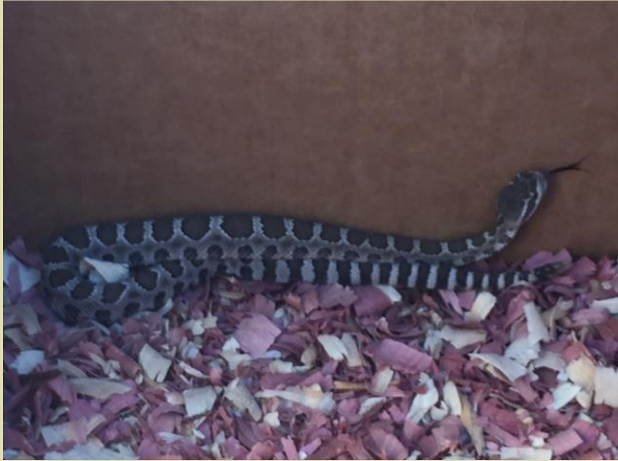
Rattlesnake seized during buy/bust operation.