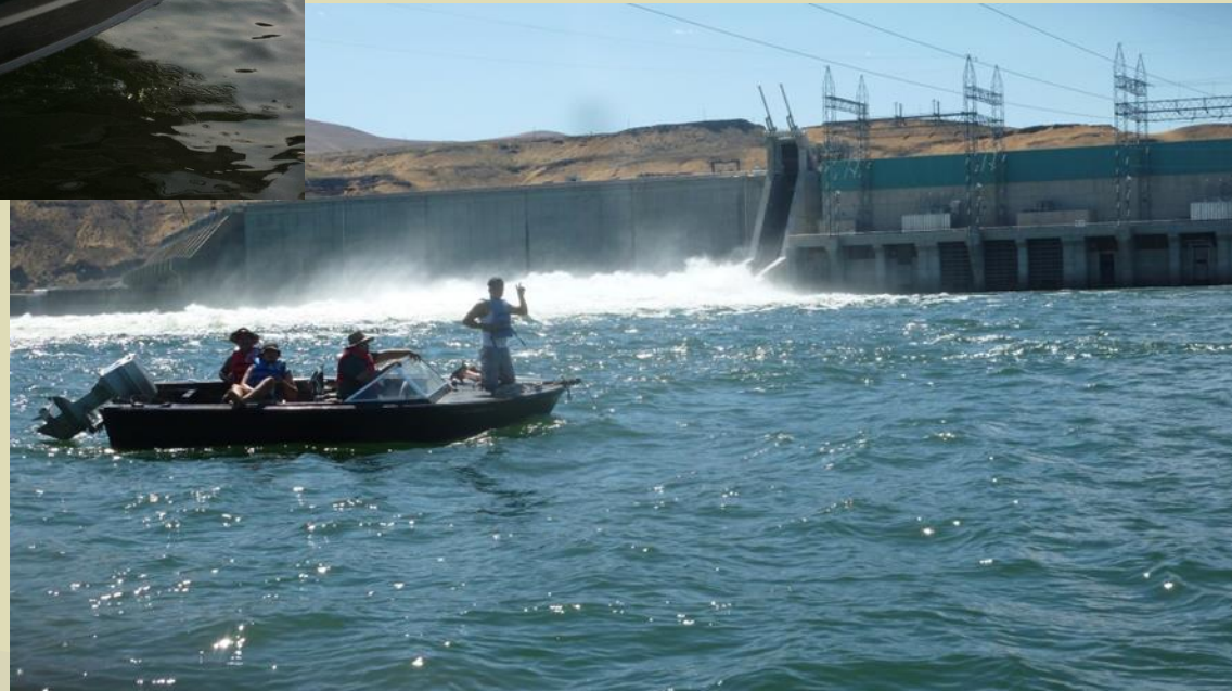
Officers Peterson and Scherzinger assisted a disabled vessel below Wanapum.