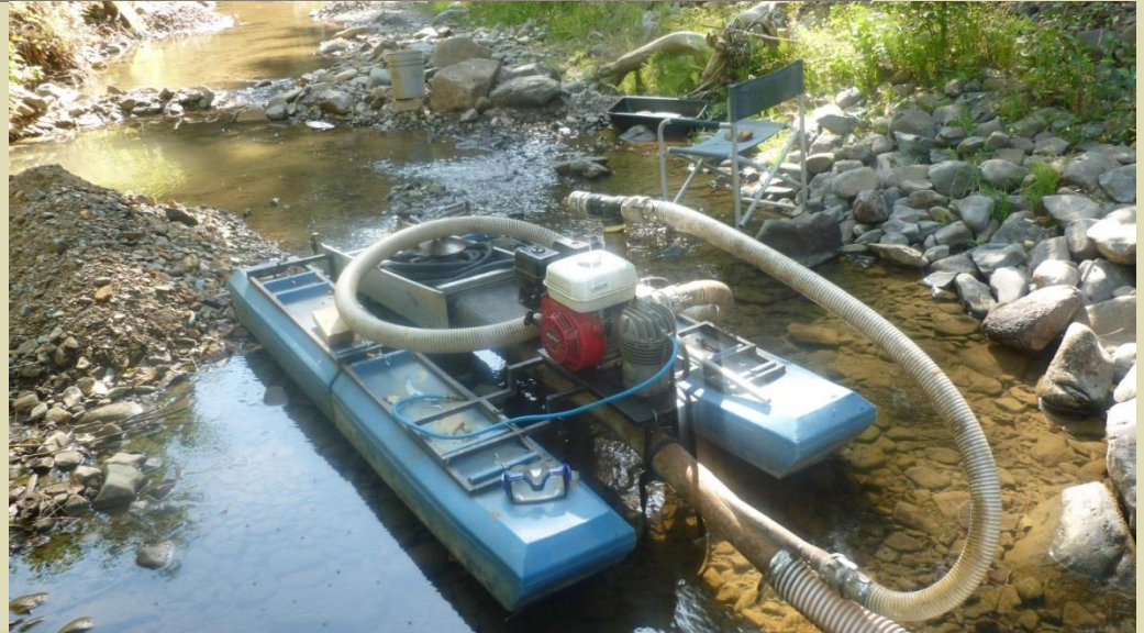
An unattended suction dredge in Swauk Creek with several violations.