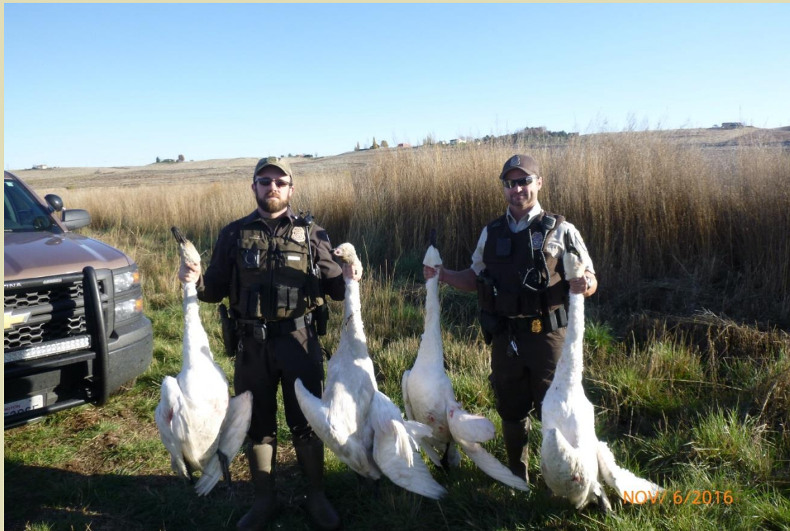
USFWS Refuge Officers with the poached swans.