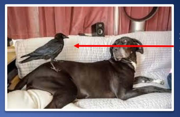
Socialized as a great dane