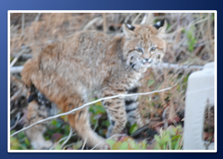
Bobcat release from Sarvey Wildlife Care Center