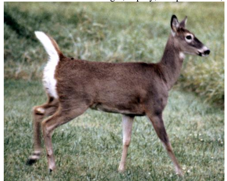
Columbia White Tail Doe

A diverse mix of wildlife can be found at LeClerc Creek. Bird species found here include bald eagle, osprey, Cooper's hawk, white-headed and