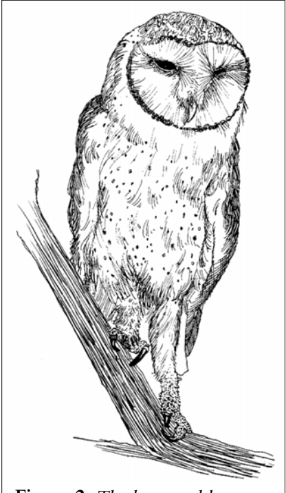
Figure 2. The barn owl has a heart-shaped face and dark eyes.

The great horned owl stands 20 inches tall and has a 48-inch wingspan. It is dark brown with black spots above; the underparts are pale brown with heavy, dark brown bars. Some subspecies are paler. All have large yellow eyes. Great horned owls can turn their heads 270 degrees either way when facing forward, but they can't turn their heads 360 degrees.