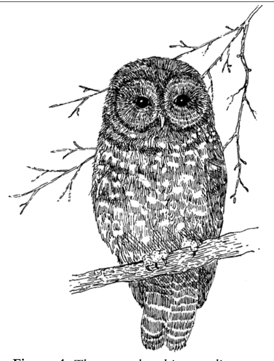
Figure 4. The spotted owl is a mediumsized owl with brown eyes and no eartufts. It is gray brown in color, with light spotting on the back and breast. They are slightly smaller than the closely related and similar-appearing barred owl.

Owls can also be viewed when crows, jays, magpies, or other birds discover them in their territory. The birds will defend their domain by diving and calling repeatedly at the perched or flying owl, an activity called "mobbing." Look and listen for this behavior and see if you can locate the "invader."