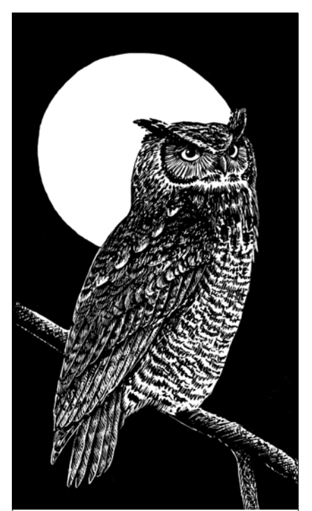
Figure 1. The large-headed, neckless silhouette and large ear tufts or "horns" of the great horned owl are hard to miss. (Drawing by Elva Hamerstrom Paulson.)