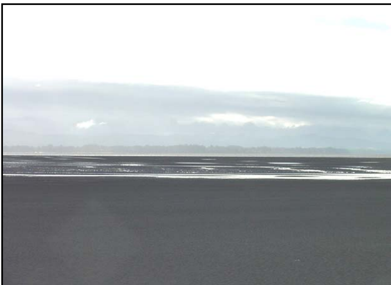
View of southernmost spit from Leadbetter Point 2006 - WDFW photo.

Similar to the 2005 season, shifting sands again required that a physical boundary at the north end of Leadbetter Point be installed. In the past a channel of water separated the spits from the north end of Leadbetter Point, even at low tide. In more recent years the southernmost spit and the northern end of Leadbetter Point are continuous and easily crossed at low water. Since regulations for the commercial razor clam fishery permit digging only on “detached” (i.e. islands) spits, a line of posts made from rebar and PVC pipe was set up to keep diggers from crossing over to Leadbetter Point.