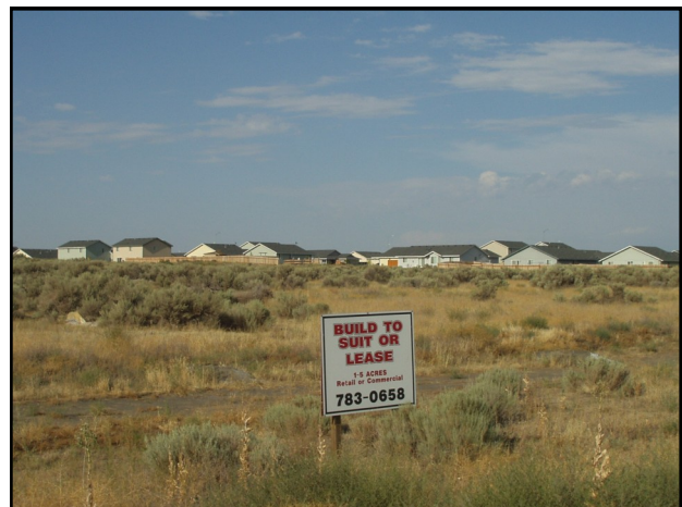
Development encroaching on an area of shrub-steppe habitat.

The Washington Department of Fish and Wildlife published a new guide for managing and protecting shrub-steppe habitat and the wildlife that live there. This guide is the latest in our agency's Priority Habitats and Species (PHS) series of management recommendations. We write these guidance documents to provide you with some ways of protecting priority habitats and priority species. Our PHS series currently include publications for five priority habitats and 84 priority species.