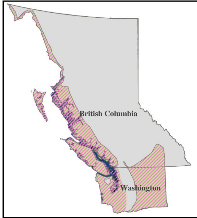
Figure 1. The hatched area is the year-round range of the Great Blue Heron ( Ardea Herodias ) in Washington and British Columbia (55).

The region's largest colonies are within the range of the Pacific Great Blue Heron ( A. h. fannini ). This subspecies differs from inland herons and from herons near south-coastal Washington ( A. h. herodias ) in that they are smaller in size. They also generally begin breeding earlier in the spring (54). The range of these birds is isolated by the mountains east of Puget Sound and Georgia Basin. Pacific Great Blue Herons mostly occur close to the coast and inland along large rivers from Prince William Sound to Puget Sound (54).