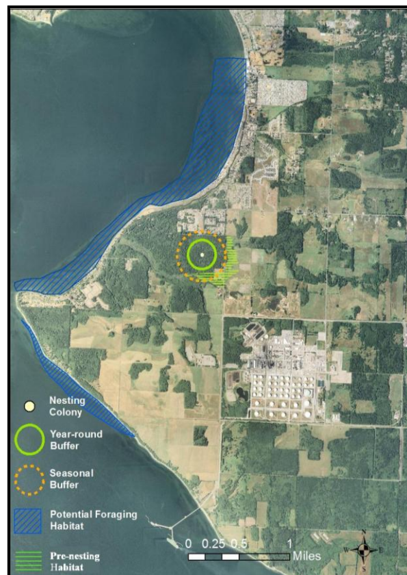
Figure 2. Depiction of all the components of a HMA.

The following guidelines will help you identify, map, and manage an entire HMA. We suggest you use the guidelines to protect any colony, no matter its size or status. Although you should not underestimate the value of smaller colonies, larger colonies generally merit highest priority. Give colonies with at least 20 nests close to coastal and estuarine habitat or along large rivers that drain into an estuary high priority (30). Since colonies inland tend to be smaller, regard all inland nesting aggregations as high priority.