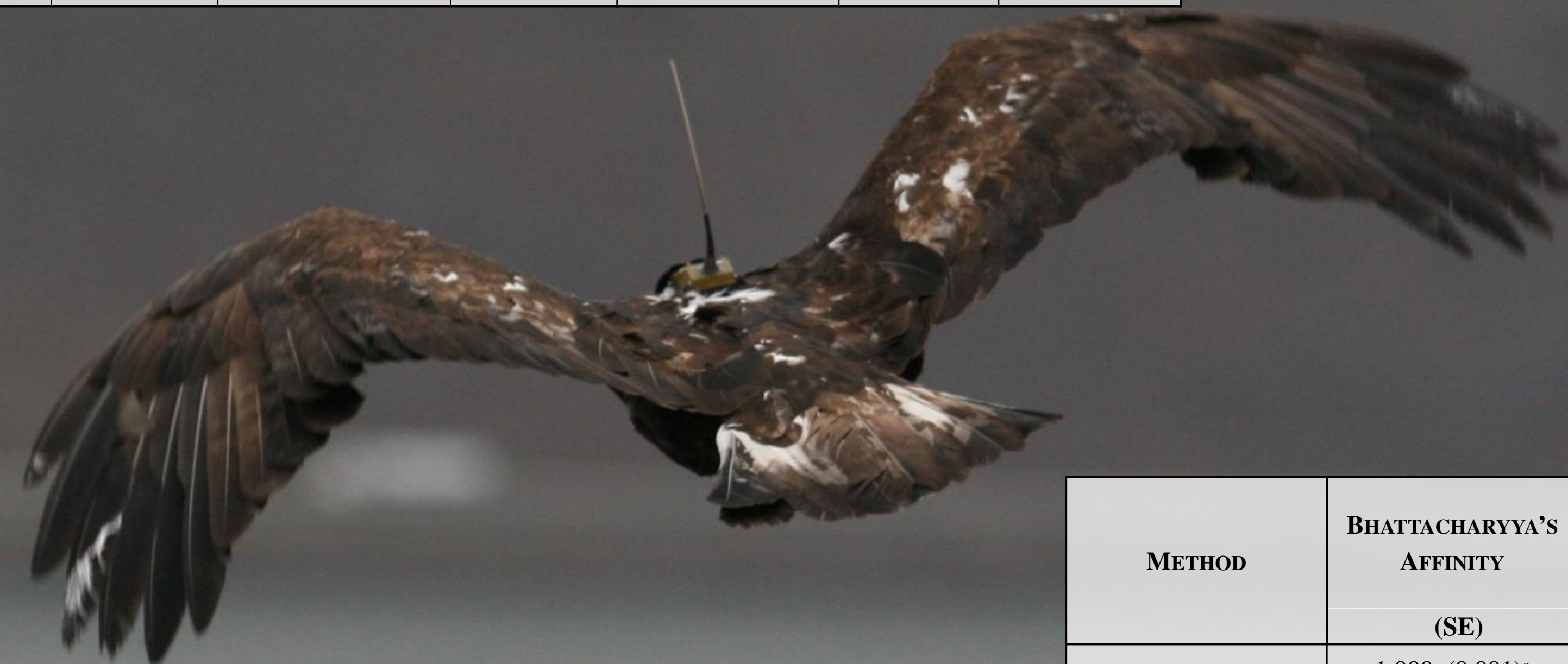
Table 2. Mean ( \pm SE) overlap indices (compared to fixed kernel h_{REF} ) for 5 different home range estimators developed using 16 breeding seasons of data for 8 golden eagles. Within a column, values for methods with the same letter are not significantly different (alpha=0.05) using the Tukey-Kramer multiple comparison procedure.