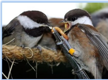
Chickadees being fed meal worms.

Animal diets can be highly specialized or very general, or somewhere in between. Raccoons, skunks, and robins are omnivores, or generalists, as are people. Cats are usually strict carnivores, eating only meat, and deer and rabbits are strictly herbivores, eating only plants. It is vitally important that you know the details of wildlife nutrition and specific food requirements. Something as obscure as a calcium to phosphorus ratio imbalance can result in metabolic bone disease which can be debilitating or even deadly.