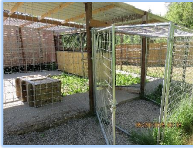
Small-medium mammal enclosure, outside. Center Valley Animal Rescue