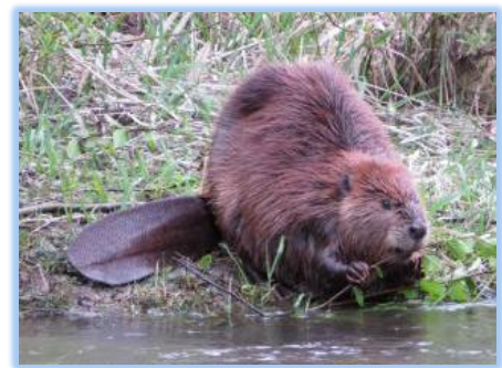
Beaver. Laura Rogers

Amphibians and reptiles have very strict release rules because of disease concerns and must be released at point of origin, without exception. It is unlawful to release amphibians and reptiles if they are a Washington state nonnative species, they have been in captivity as pets, school, or research specimens, or they have