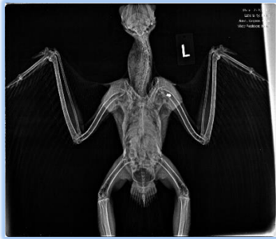
Gunshot Red-tailed Hawk. Blue Mountain Wildlife