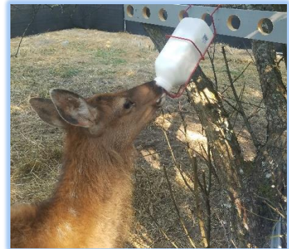
Elk feeding at bottle rack with no human contact. A Soft Place to Land

Imprinting occurs in very young animals at a precise critical period where the animal fixes its attention on and follows the first object or creature it sees, hears, or touches, and becomes socially, and later sexually, bonded, identifying itself as whatever it imprints upon. Mal-imprinting means imprinting on a species not its own. If the animal imprints upon you, it will believe it is supposed to follow you and do what you do resulting in the animal not recognizing its own species and preventing its release. Imprinting persists into adulthood, is permanent, and cannot be reversed.