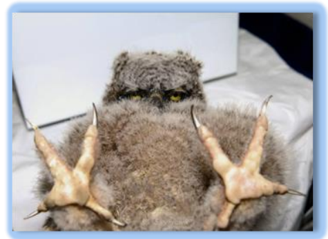
Owlet. Sarvey Wildlife Care Center

The most important aspect of animal restraint and handling is protecting yourself and your staff against injury. Animal restraint classes are offered by several organizations. You may also train with an experienced wildlife rehabilitator. Restraint skills take experience and an intimate knowledge of a species' behavior and anatomy. You or the animal can be injured due to improper technique. Without proper gloves, rabies poles, etc. even small mammals such as squirrels can give serious bites. Unless you are suitably prepared to restrain a given species and protect yourself, you should not accept it into your facility.