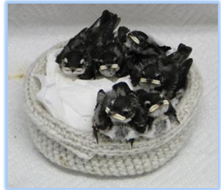
Violet Green Swallows. Featherhaven

Accurate species identification is crucial for raising orphans correctly, knowing which diseases and parasites occur in what species, and for administering the proper medications. Treatments, housing, and diets are often species-specific. You will be asked to record animal admissions to species on your Daily Ledger (for example Song Sparrow not “sparrow”). Some field guides and other natural history books are listed below for your reference. Also consult local colleges and universities and websites such as the UW Burke Museum and bird conservation organizations such as the Audubon Society. You may ask any licensed wildlife rehabilitator for reference materials. One way to start identifying a species is to know if it even occurs in Washington State or the Pacific Northwest.