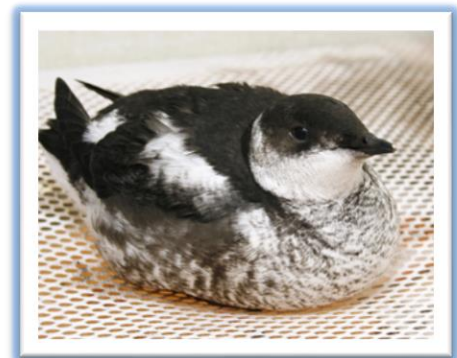
Marbled murrelet ( Brachyramphus marmoratus ) State Endangered and Federally Threatened. Kevin Mack, PAWS Wildlife Center

species is more important or valuable than another and be forced to choose which you treat and which you do not. Many people, particularly biologists, believe that common nuisance animals and introduced species (see https://wdfw.wa.gov/species-habitats/living/nuisance-wildlife ) should not be rehabilitated and released. Many introduced species are highly competitive and destructive to some of Washington's native wildlife. It is considered by some to be ill-advised to rehabilitate and release, for example, European starlings, house sparrows, Eastern gray squirrels, and red-eared slider turtles. European starlings, for example, kill native songbirds to take over their nests. However, the argument can be made that by learning rehabilitation techniques on common species, one develops skills that can be applied to native and rare species.