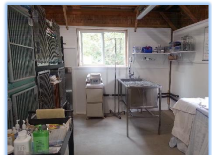
Exam room with restricted care kennels. Discovery Bay Wild Bird Rescue

Wildlife species have a wide array of housing and enclosure requirements for their physical and psychological health. They need everything from safe caging, proper food display, to appropriate enrichment activities. You will need to know housing requirements for many species and groups of animals if you wish to rehabilitate multiple species. Minimum housing requirements are in NWRA’s MINIMUM STANDARDS FOR WILDLIFE REHABILITATION 4 TH ED listed in Study Guides . You must be particularly good at isolating wildlife from humans.