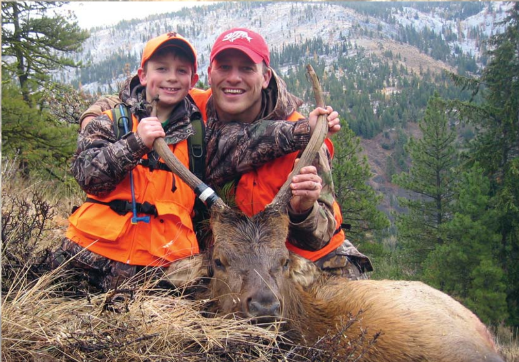
Safe hunters with their harvest