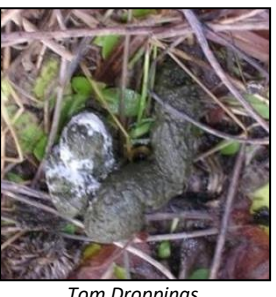
Tom Droppings