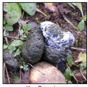
Hen Droppings

it also may mean that they just passed through. Try a locator call or soft clucks and yelps if you find a lot of droppings to see if there are turkeys in the area. If you find a lot of droppings below a tree, you may have found the roost tree. Make sure to take note of where the tree is so you can use the knowledge to your advantage.