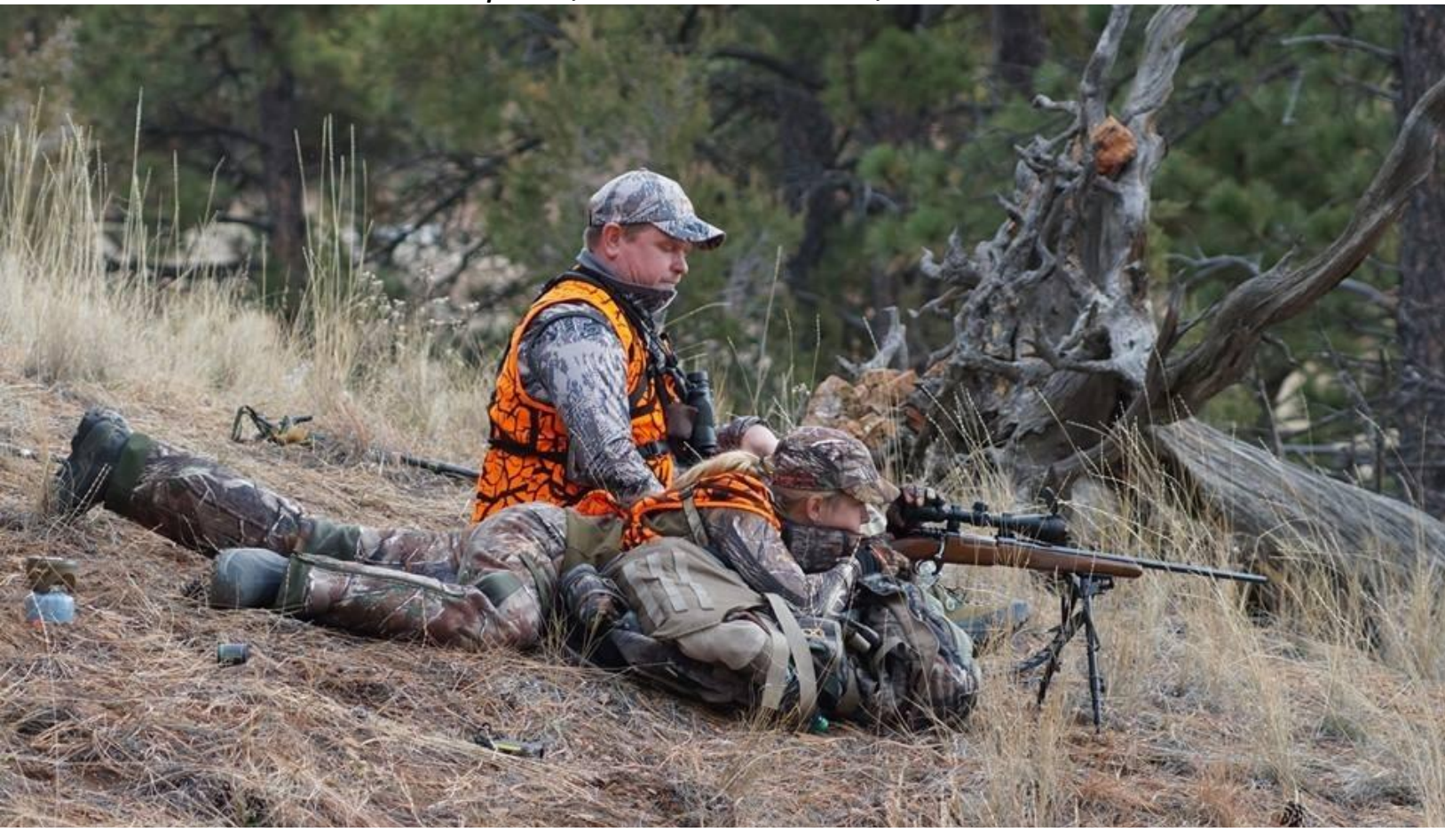
A successful hunt, as shown above, is defined by the memories made during a safe time afield Safe hunting is no accident