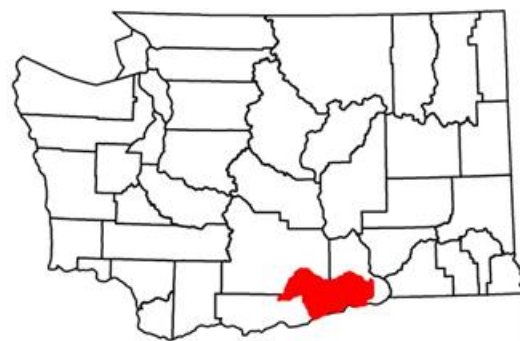
Figure1. The survey area (red) including portions of Benton, Klickitat, and Yakima counties.

Our survey was conducted in portions of Benton, Klickitat, and Yakima counties in southcentral Washington (Fig. 1). The dominant habitat types are a mix of croplands (primarily winter wheat and crops with center pivot irrigation), Conservation Reserve Program (CRP) land, grazed rangeland, and shrub-steppe communities. In the central Basin of Washington, the winter of 2016-2017 was the coldest in over 30 years, with above average snowfall (NOAA 2017).