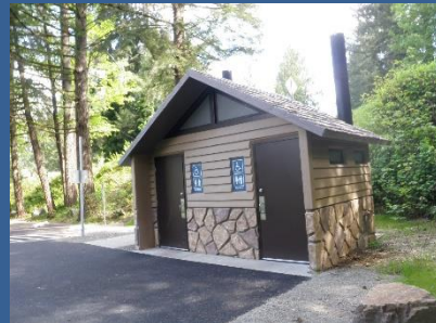
Black Lake Boat Launch