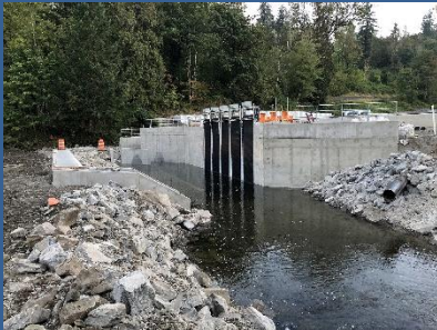
Soos Creek Hatchery