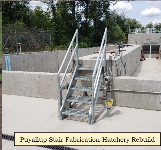
Puyallup Stair Fabrication-Hatchery Rebuild