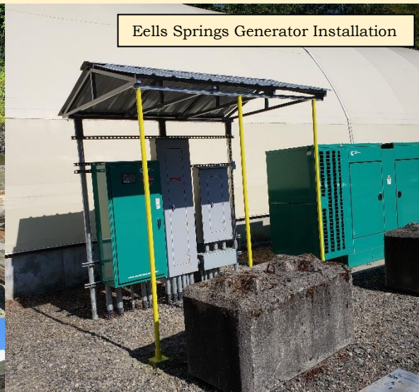
Eells Springs Generator Installation