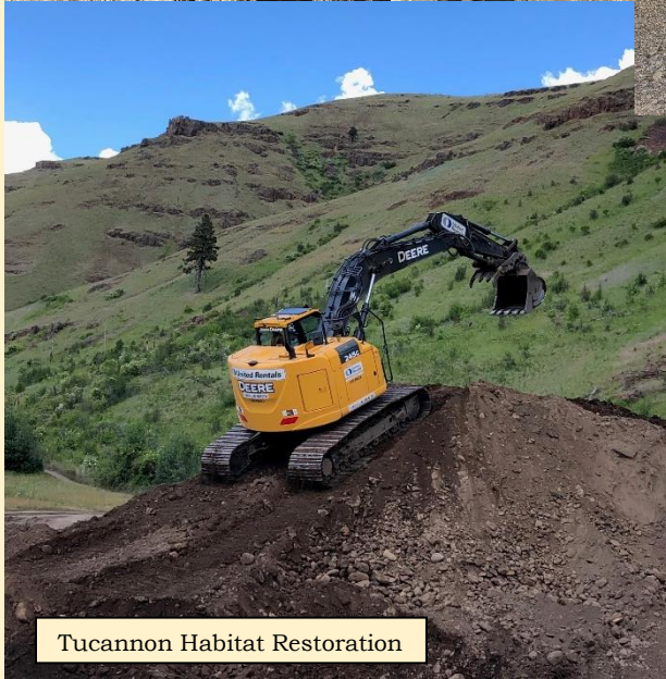
Tucannon Habitat Restoration