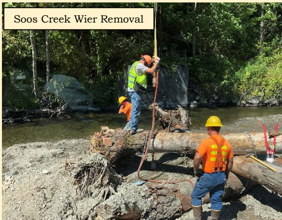
Soos Creek Wier Removal